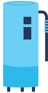
Hot Water Tank