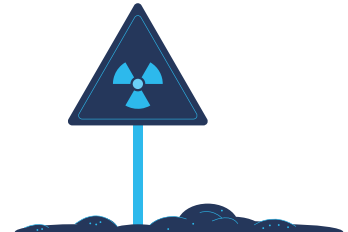
Contaminated Soils and Absorbents