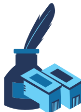
Ink and Resins