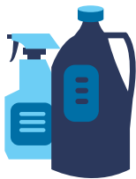
Household Cleaning Fluids