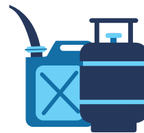
Oils, Fuels and Propane Tanks