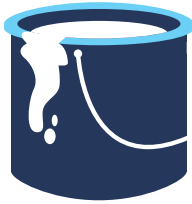
Paint and Lacquers